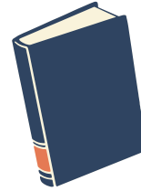
A best-seller, hardcover novel