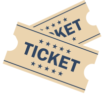
A movie date for two

Could you do without one of these items each month to pay for tenant insurance?