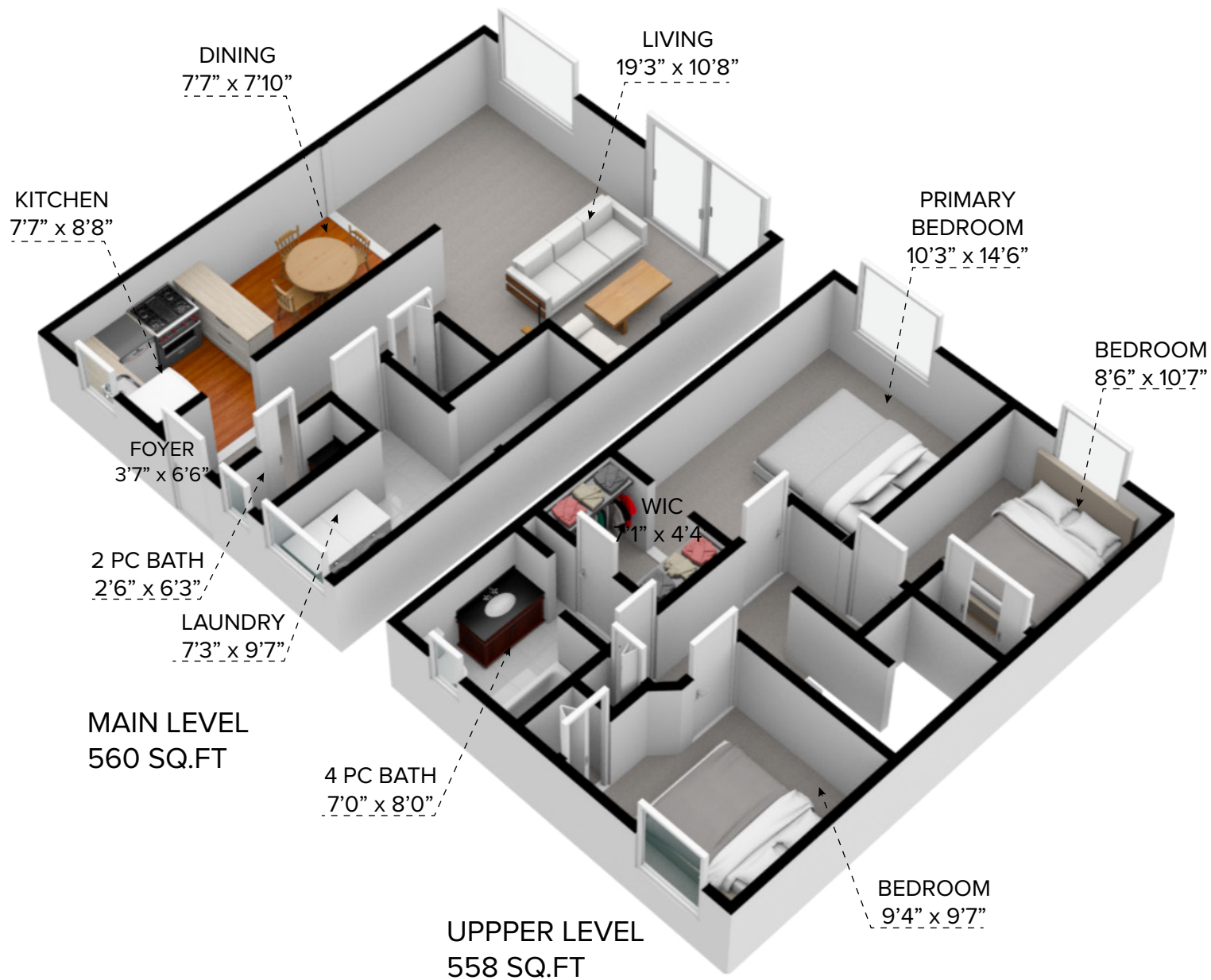
10300-T3-A1 - 3 Bedroom (1,118 sq.ft)

All dimensions are approximate and no responsibility is taken for any error, omission or misstatement. Size and specifications are subject to change without notice. This plan is for illustrative purposes only and should be used as such.