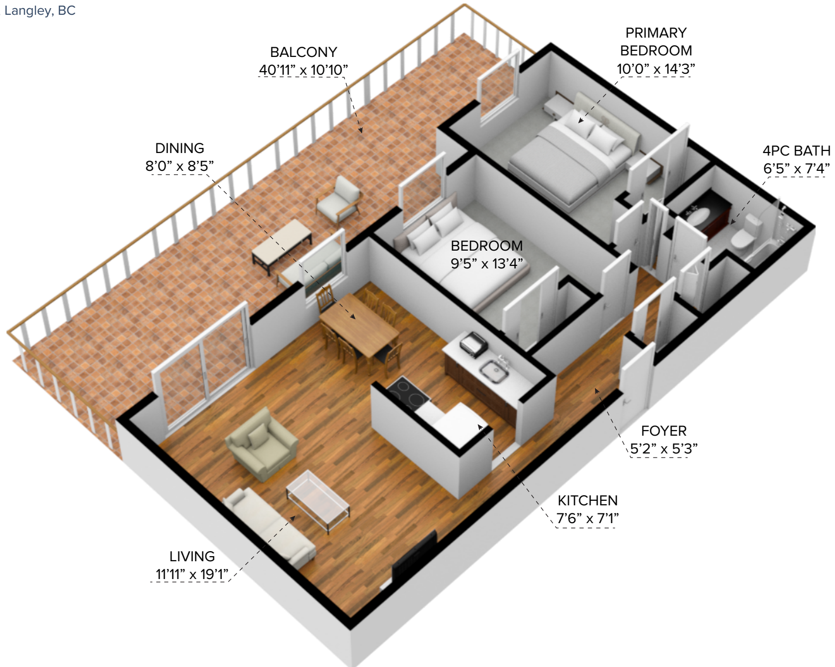
10374-2-A2 - 2 Bedroom (861 sq.ft.)

All dimensions are approximate and no responsibility is taken for any error, omission or misstatement. Size and specifications are subject to change without notice. This plan is for illustrative purposes only and should be used as such