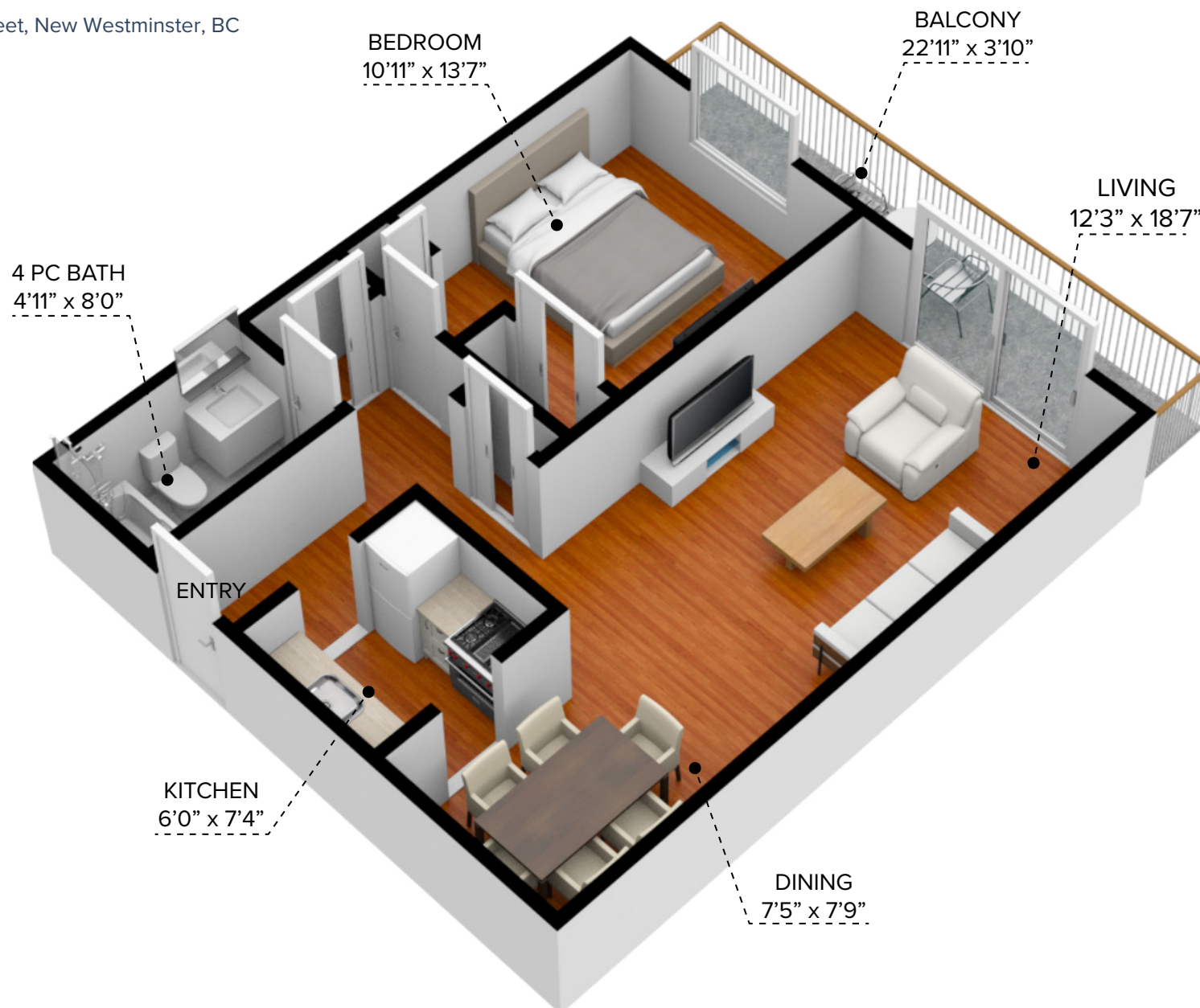
10333-1-A1 - 1 Bedroom (655 sq.ft.)

All dimensions are approximate and no responsibility is taken for any error, omission or misstatement. Size and specifications are subject to change without notice. This plan is for illustrative purposes only and should be used as such.